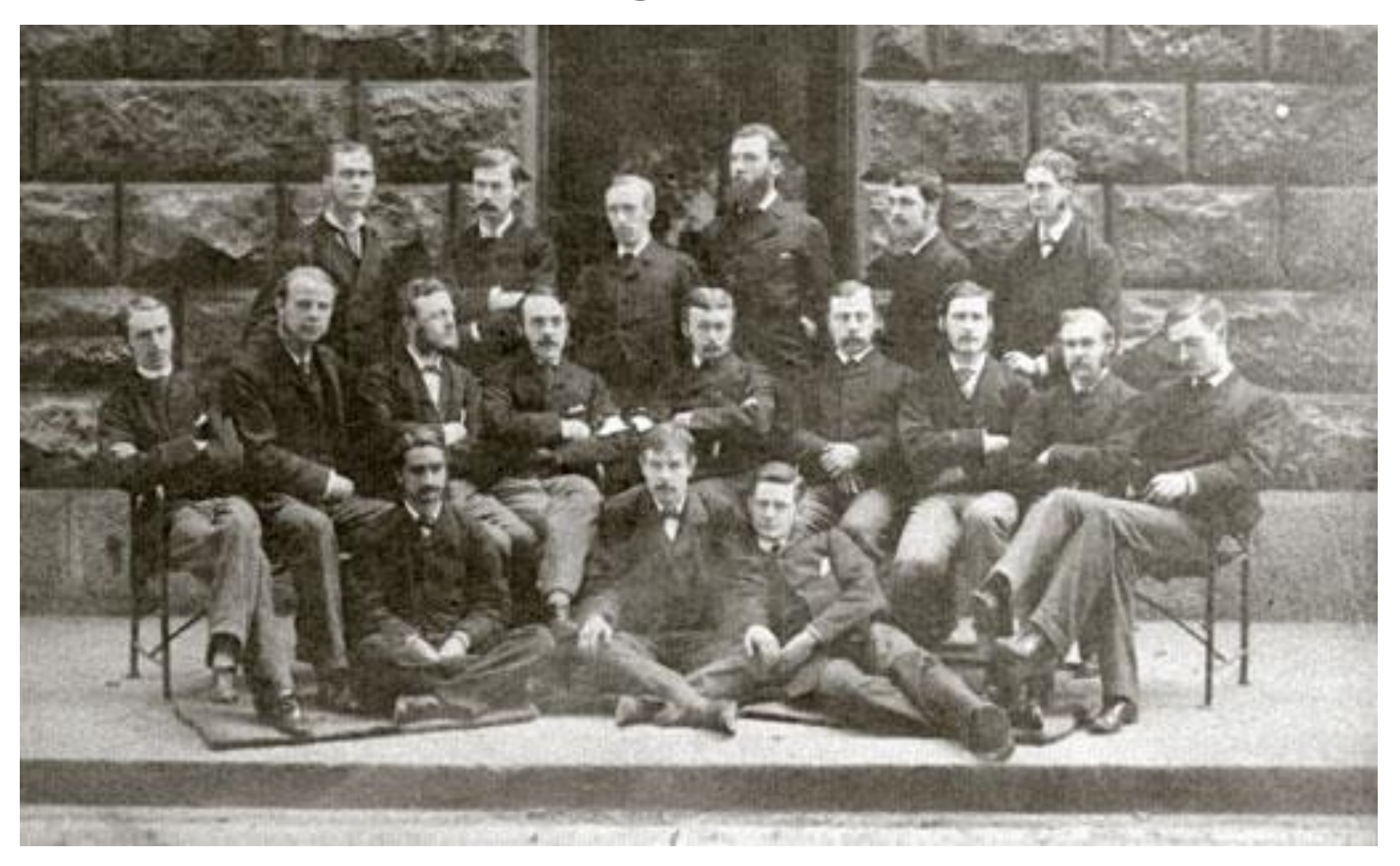
Lothian Health Services Archive