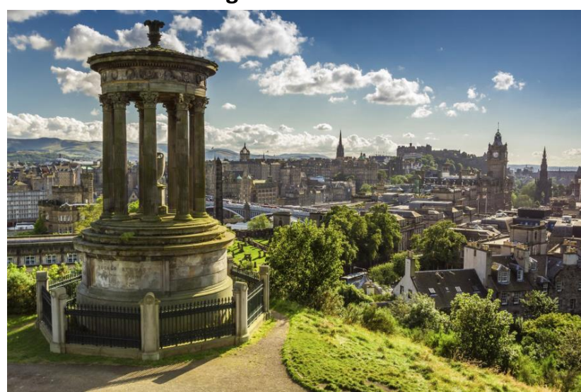
The Edinburgh Consensus Statement

From the themes raised and discussed, and the key messages, a consensus statement was written: